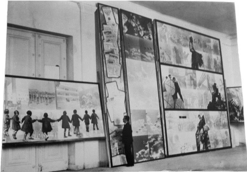
Figure 11.2 Nelly, Collages exhibited in the 1939 Greek Pavilion