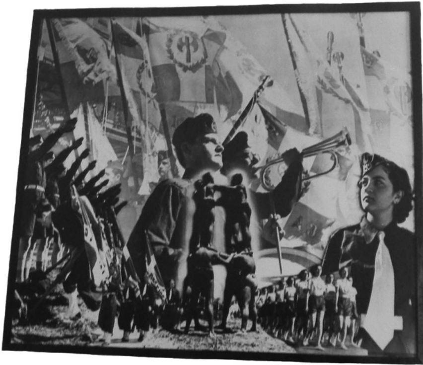
Figure 11.3 Nelly, Collage for the Metaxas regime's youth (EON)