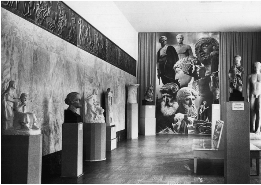
Figure 11.1 Nelly, Collage of Greek physiognomies decorating the hall of ancient sculptures where five originals, a number of replicas by Emile Gilliéron & Son, and some contemporary sculptures are exhibited in the Greek Pavilion 'Hall of Ancient Sculptures' at the 1939 New York World Fair